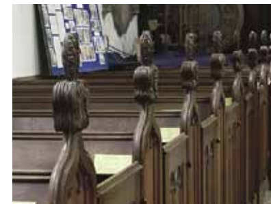
Hatfield Broad Oak