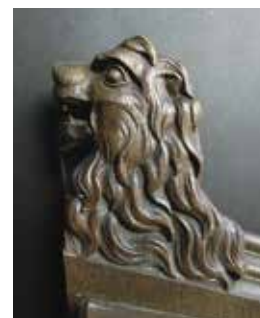
Much Hadham - lion