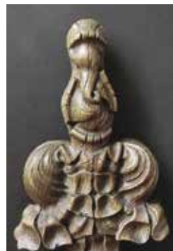
Bartlow - perhaps an elephant