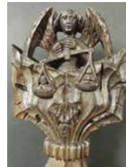
Ickleton - St Michael