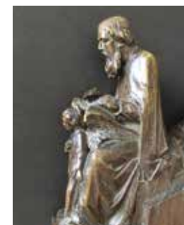
Linton - scribe and ange