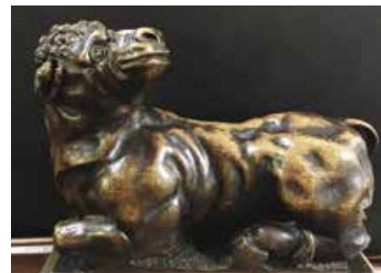
Hatfield Broad Oak - Bull representing St Luke