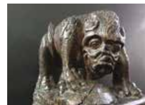
Wendens Ambo - beast