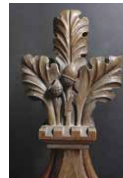
Barley - acorns