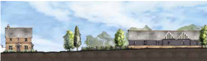
Image showing an architect's illustration of how the medical centre might look.

For more information about Mulberry Homes visit: www.mulberryhomes.co.uk